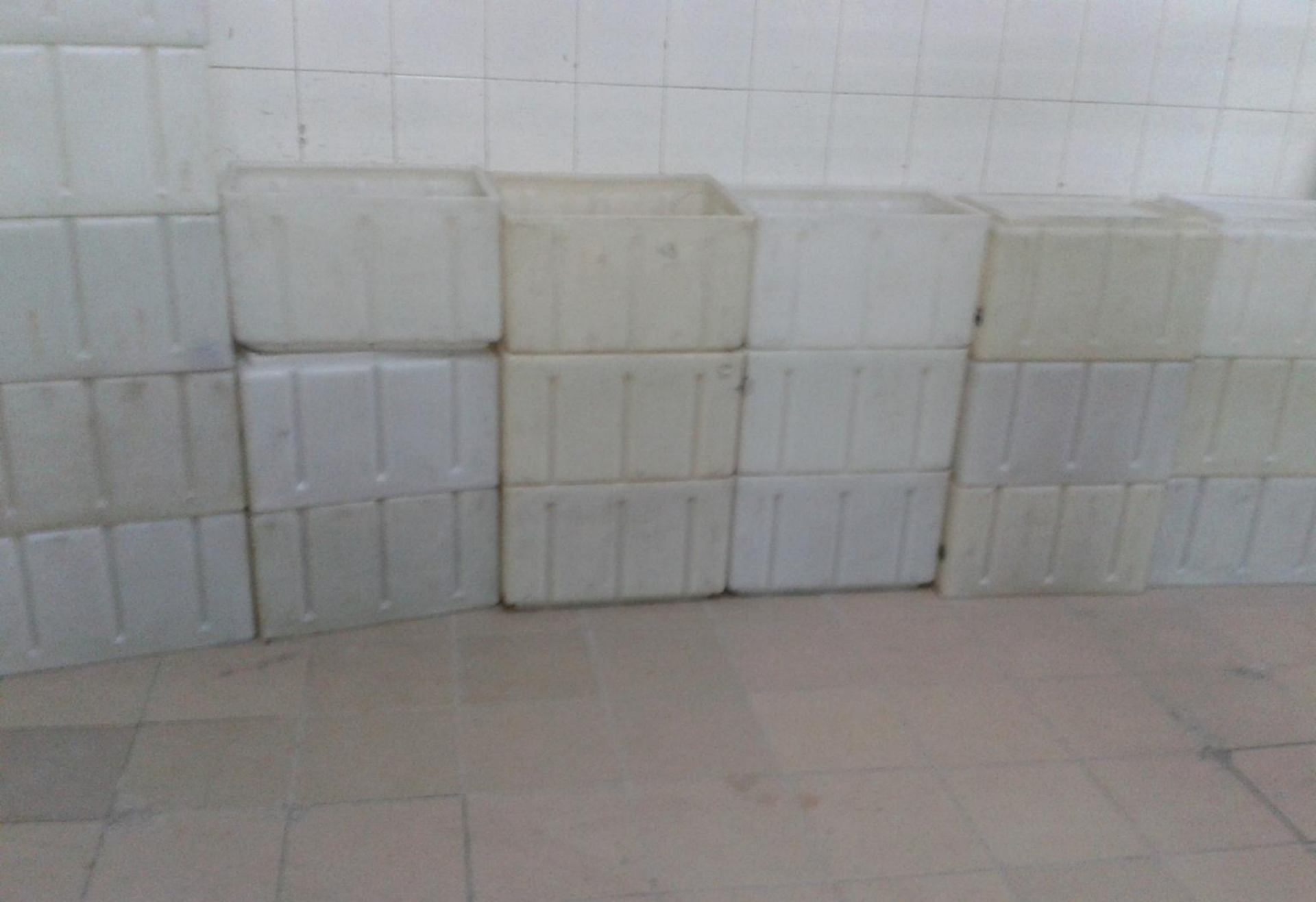
2S (Set Location) for empty buckets