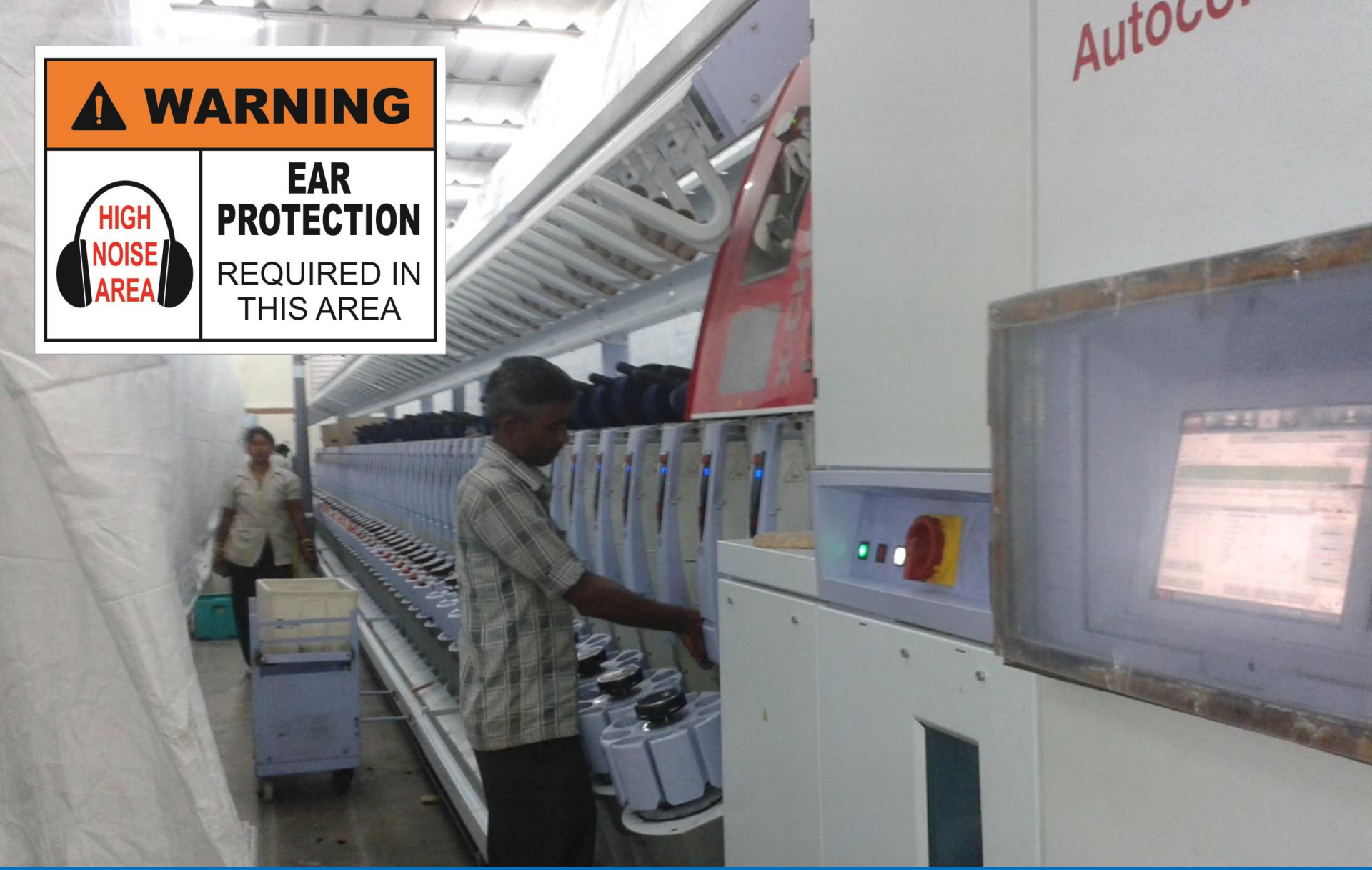
Operators should be equipped with ear plugs for safety.